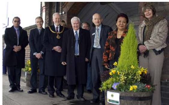
Wilmslow station garden project launched

Garden projects are being developed at Chelford, Goostrey, Holmes Chapel, Sandbach and Wilmslow stations to improve the appearance of the stations and also promote tourist opportunities, in conjunction with Cheshire Year of Gardens 2008 and local volunteers and businesses. Chelford and Handforth stations both won awards in the 2007 Cheshire Best Kept Station awards in recognition of their work in transforming the station environment.