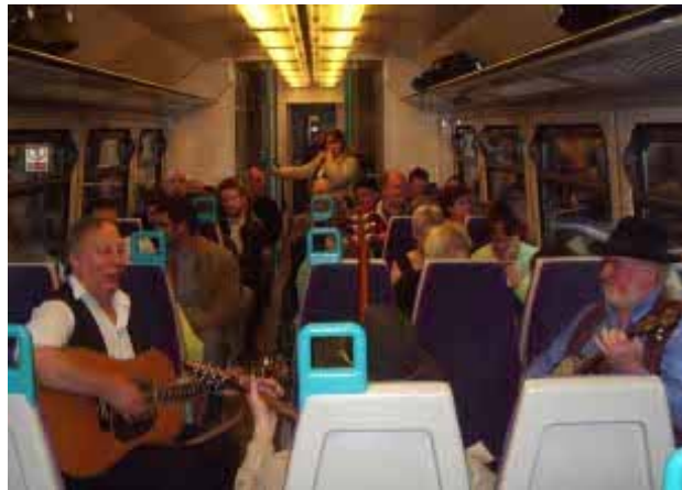
Goostrey Folk Train

Monthly live music events on trains from Manchester to Goostrey, and then hosted in a local pub, have been established, with an average attendance of 35-40. The costs of these are now partially met by the pub involved.