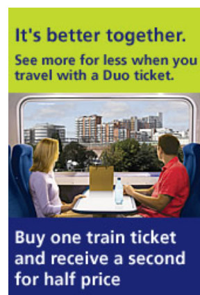
Northern Rail 'Duo' leaflet

A marketing campaign to boost off-peak travel through sales of 'Duo' tickets (provide 25% off price of 2 adult cheap day returns) was carried out by Northern Rail through doorstep leaflets in partnership with the Community Rail Officer. Duo ticket sales on the line have increased by 21.2% since April 2007.